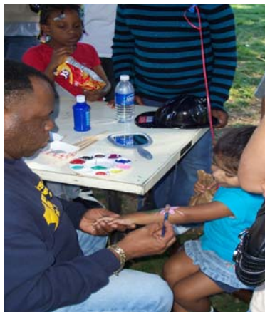
Face and arm painting by one of many volunteers.