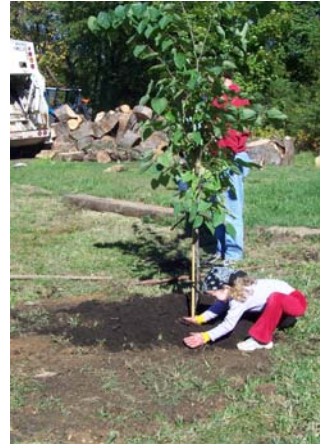
Tree Planting behind Riverdale Elementary. Thank You to All Volunteers!