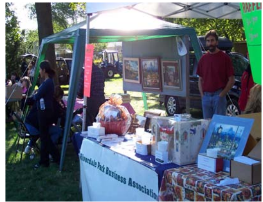
Riverdale Park Business Association displays their raffle prizes.