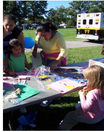
Kids enjoy making crafts.